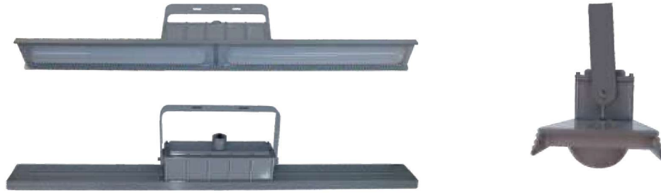
2FT/4FT Linear High Bay